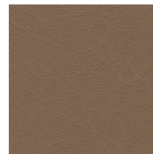
TRUFFEL NAUTICAU TF