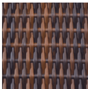
SABLE RESIN WICKER B